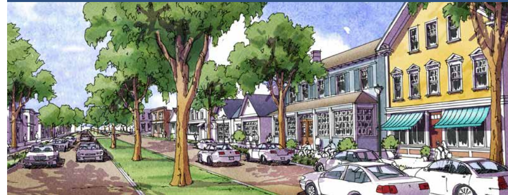
Illustrative plan created by the Town Planning & Urban Design Collaborative, LLC for the town of Yarmouth