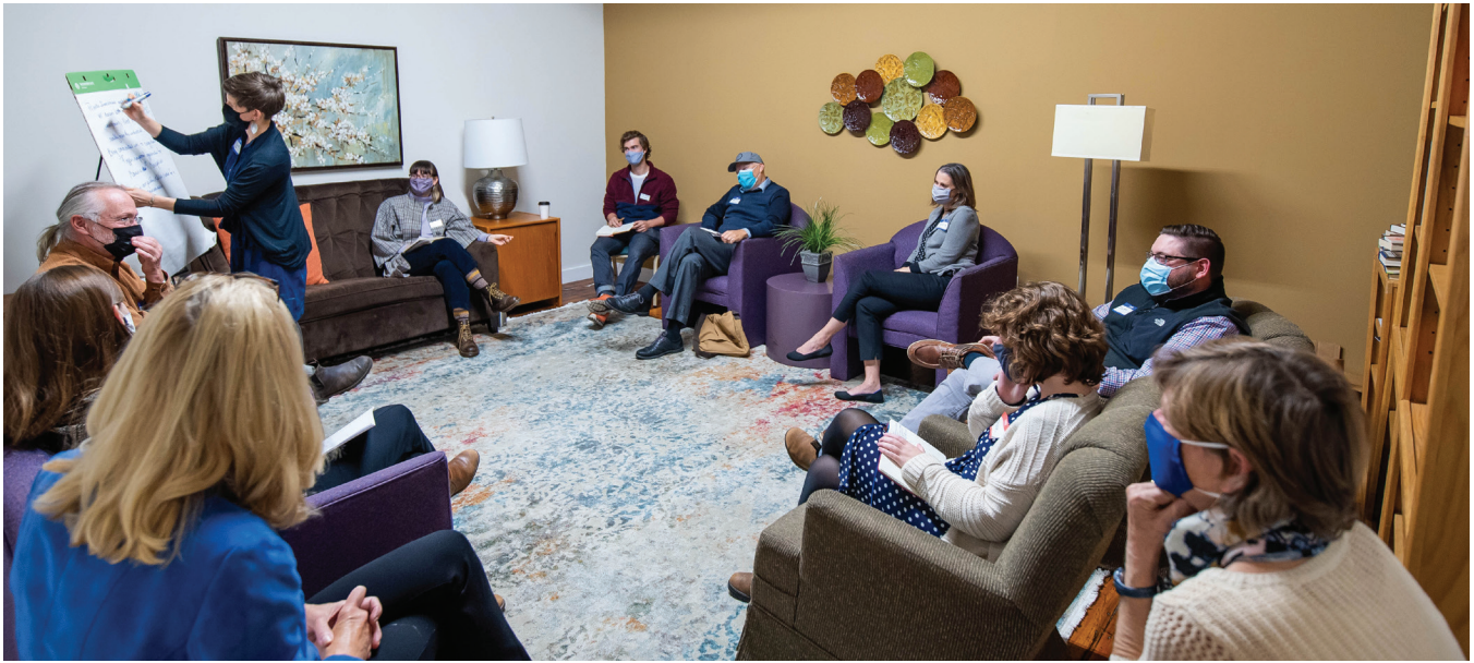
Policy Action breakout room in action during GrowSmart Maine's 2021 Summit in Biddeford.