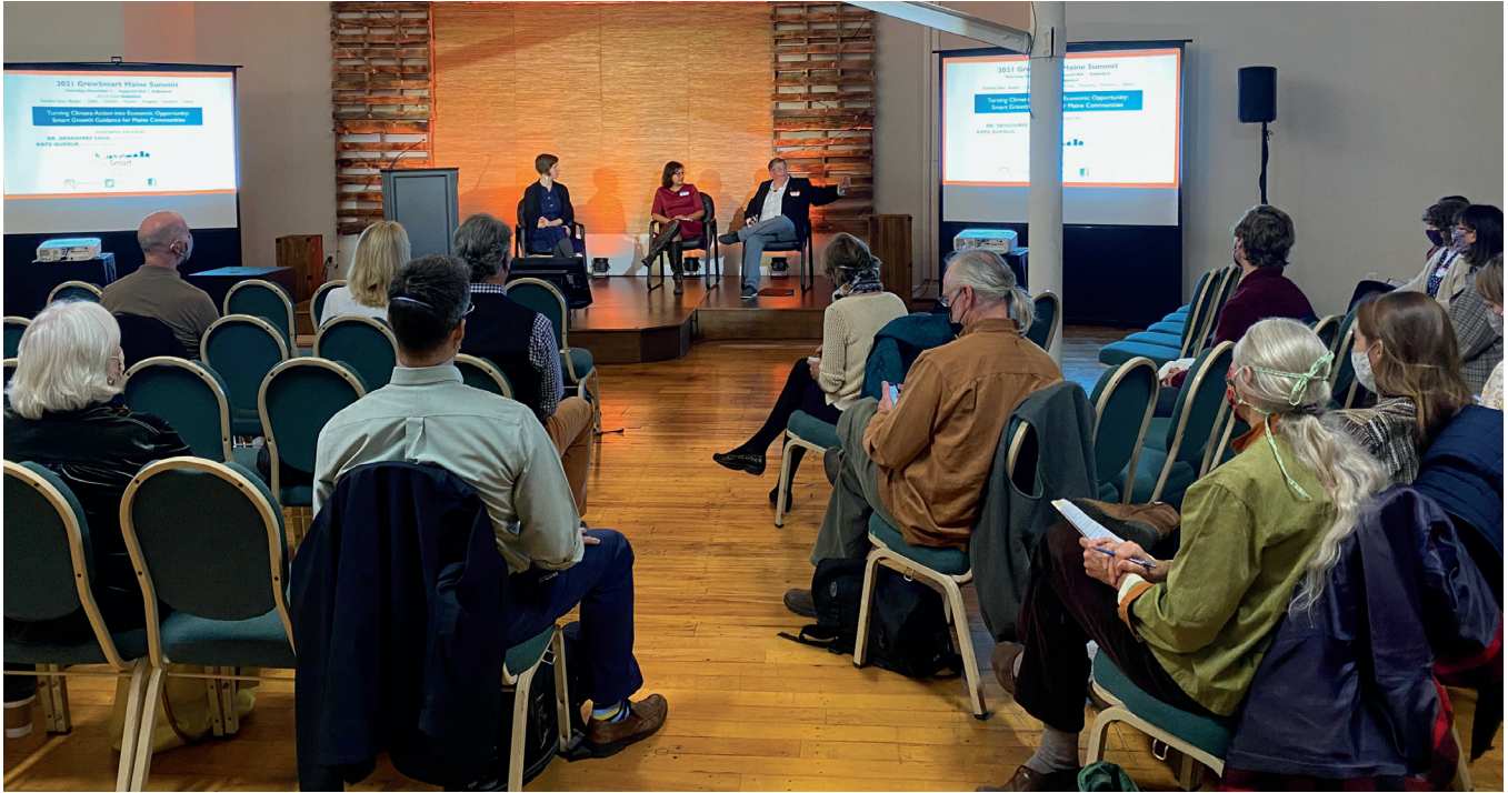
GrowSmart Maine's 2021 Summit at the Pepperell Mill Campus in Biddeford.