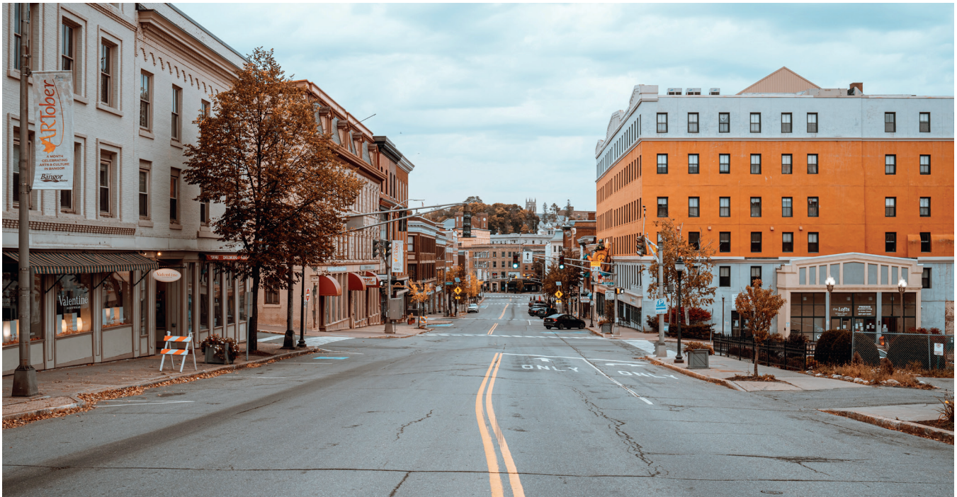
Photo of downtown Bangor