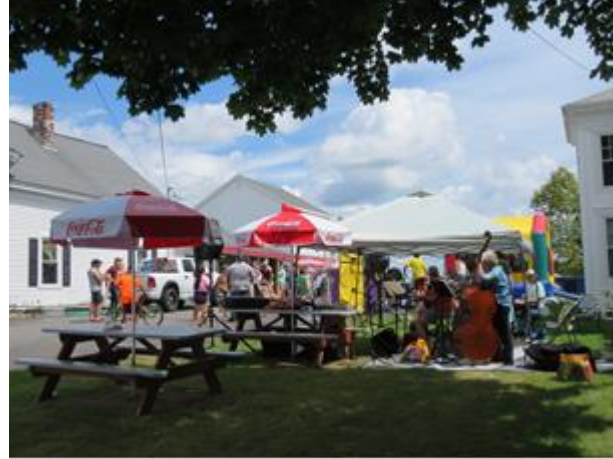
Happy Parade Watchers