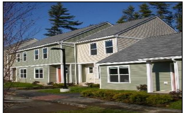
Ledgewood Court; Damariscotta, Maine

As awareness of environmentally sensitive design grows, developers are responding. Ledgewood Court apartments, in Damariscotta, received the 2005 Friends of Midcoast Maine Award, not only for its affordable units, but for its minimal intrusion on the natural environment. All 24 units were built on a 3.5 acre corner of a 10.5 acres parcel, preserving the remainder as open space. All storm water is handled on-site without impacting local water bodies.